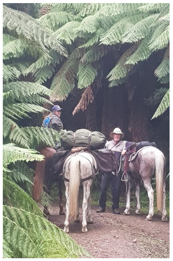
A forest of tree ferns in contrast to the dry stony ridges.