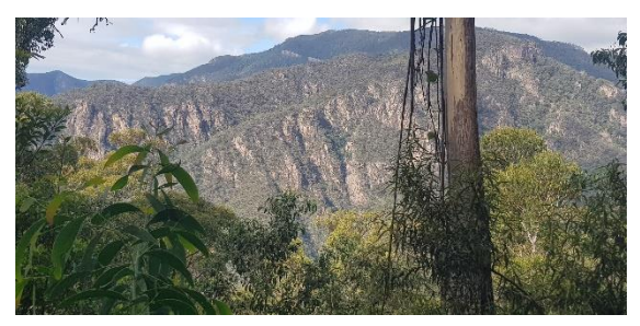
Wadbilliga National Park- spectacular rocky ridges.