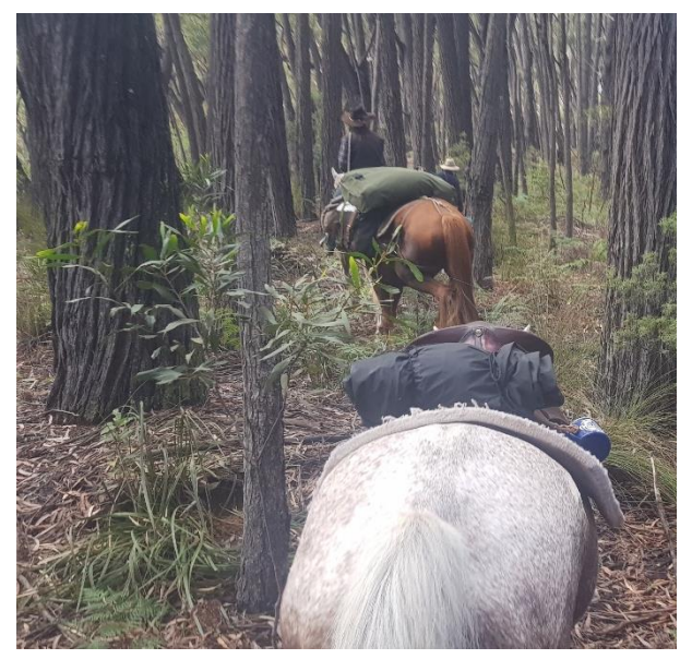
Descending the WD Tarlinton Track to Belowra.

MEMBERSHIP SUBSCRIPTIONS NOW DUE: Family $20.00. Pensioner $5.00. Individual $10.00. Corporate $100.00 includes GST.