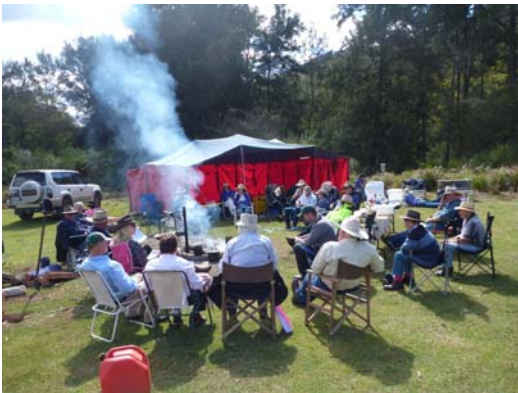
The Meeting in progress.

Our newly appointed secretary, of the younger generation, was so impressed with the experience of riding to the