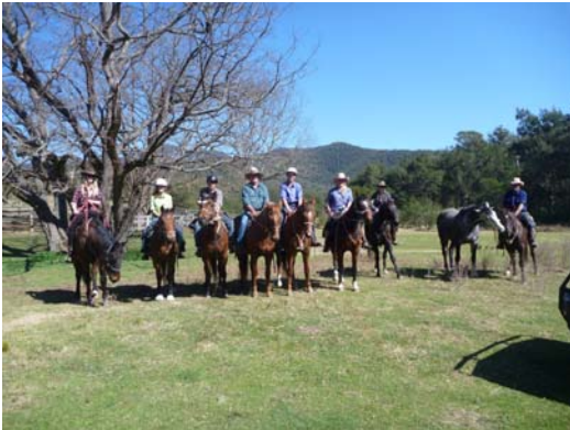
Those who arrived by horse.

The last meeting of AFA was held at Bendethera. Some arrived by car and some on horse-back. Most camped the night and enjoyed the magnificent surroundings and the good camp fire yarns.